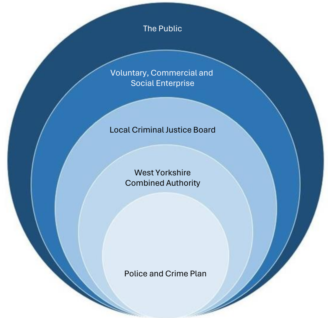
A diagram of the relationships between stakeholders involved in the Police and Crime Plan.

Policing and Crime Commissioning Strategy 2022-2024 (westyorks-ca.gov.uk)