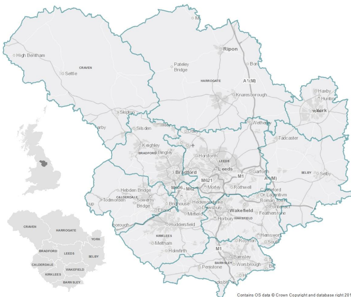
Figure 1 – Leeds City Region Statement of Common Ground Administrative Areas