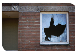
Damaging your things.