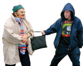
Stealing your things.